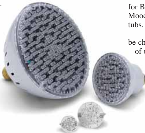
Above: The ColorGlo™ Radiance™ light, from J & J Electronics Inc.

"There is a major misconception that the more LEDs that are used in a light, the better it will illuminate the pool. But it's not a question of the number of LEDs used – but the type of LEDs being used," he states. "A single intensity 'illuminating' LED will produce more light than a cluster of 30 low-end indicating LEDs. These low-end lights do what they are supposed to do – provide light showing that they are turned on, such as in a traffic light – but the light from these fixtures is concentrated and does not spread over long distances. In a pool, you can tell that these lights are turned on even during the day – but the pool will not be illuminated – even at night."